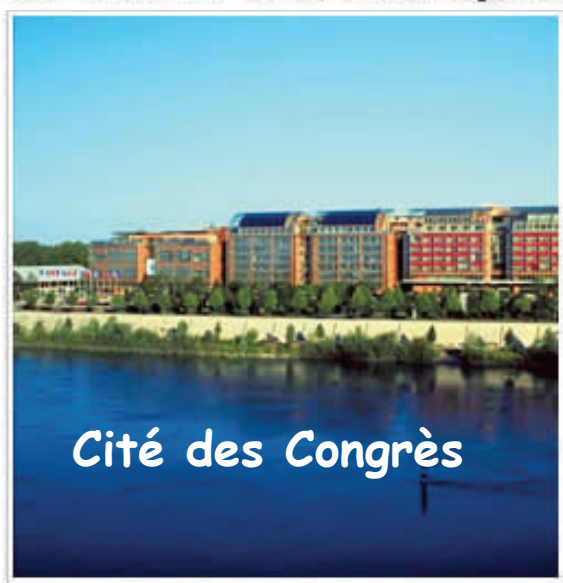
Congress Palace, Lyon, FRANCE